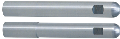
C-APU (Tapped type)